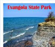
Evangola State Park

Campers will rotate through playground, sand sculpture, beach walk and swimming stations and picnic in the Park